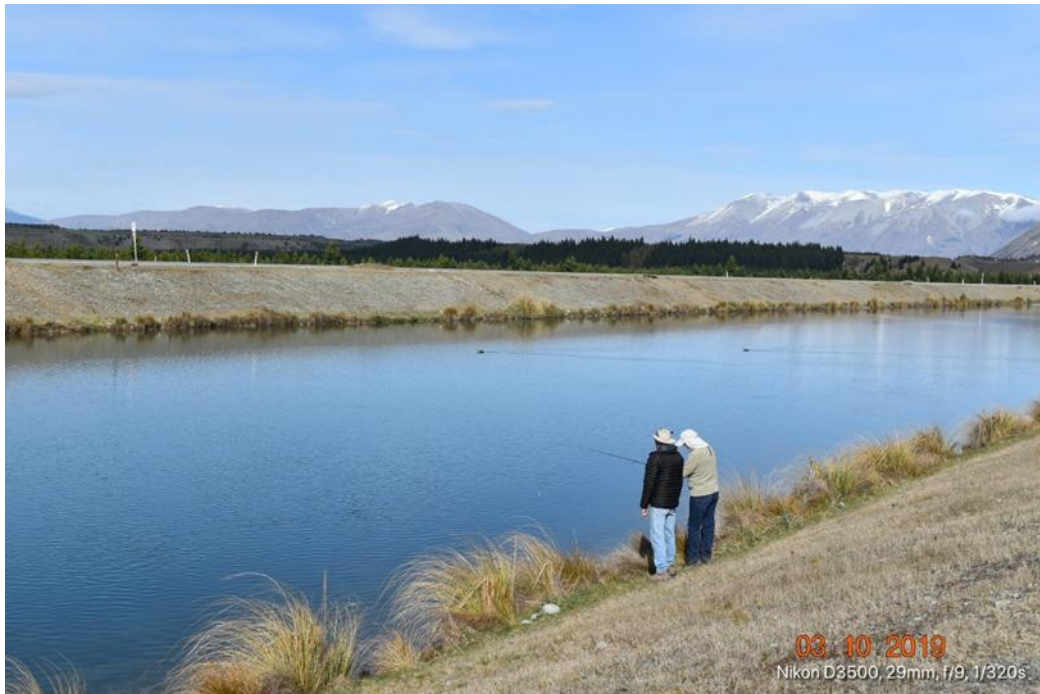
Photo: Canal system in Twizel.

The water in the system is is mostly glacial blue fed by waters from the Mt Cook area and glaciers that feed into Lake Pukaki. Salmon farming occurs in the canals and this is where trout feed under the salmon pens.