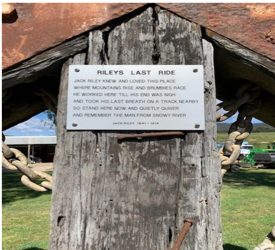
Tom Groggin Station

Next Executive Committee meeting Thursday 28th November 2019 7:30PM