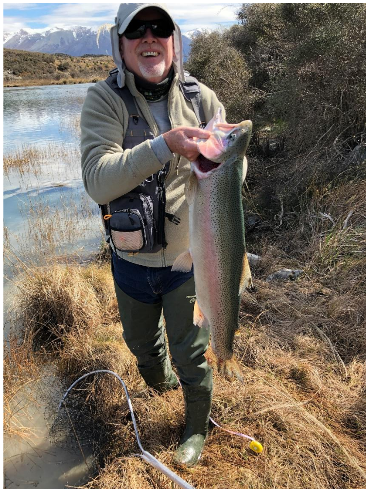
Photo: A Rainbow hen, +20 lb and over 80 cms in length caught in the Ohau River.

Next I planned to fish the Lumsden and Mossburn area rivers however, inclement weather resulted in fast and dirty rivers from prior heavy rain compelled the Guide to cancel. I fly fished the Waiau River south of Te Anau as an alternative without success.